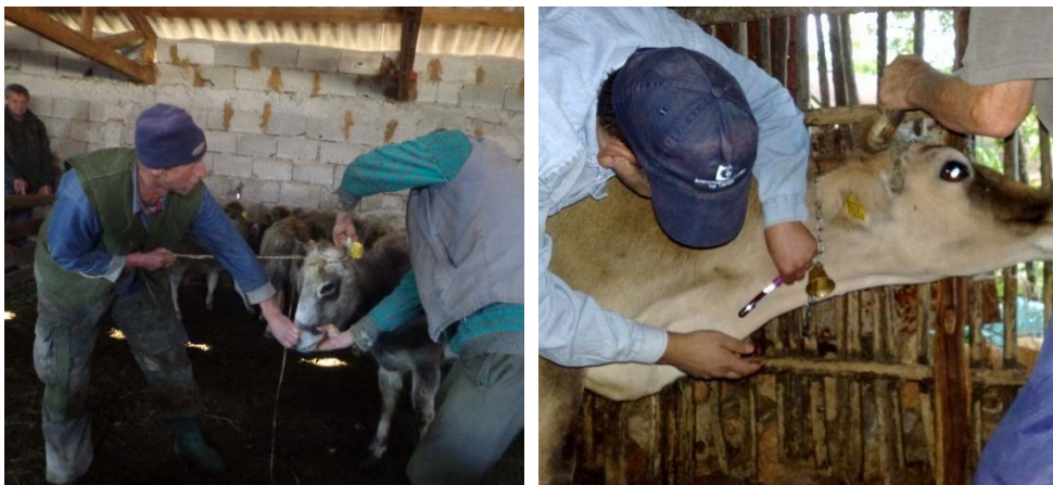
Pictures 1 and 2 Restraining (fixation) and blood sampling of Busha cattle

As regards tissue sample collection, the focus was placed on blood, hair and semen sampling for the Busha cattle gene bank.