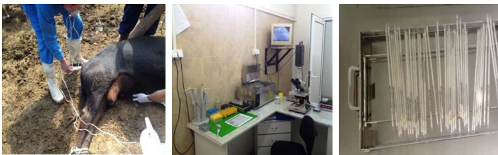
Pictures 5, 6, and 7 Restraining (fixation), electroejaculation, semen collection, testing and packaging of semen in straws from Busha bulls

The collection of data for phenotypic traits and tissue conservation for the gene bank was conducted by a team of experts from 3 Skopje institutions - the Faculty of Agricultural Sciences and Food, the Institute of Animal Production and the Faculty of Veterinary Medicine. All tissue samples collected from the autochthonous cattle breed Busha for the gene bank are owned by the Ministry of Agriculture, Forestry and Water Economy of the Republic of Macedonia.