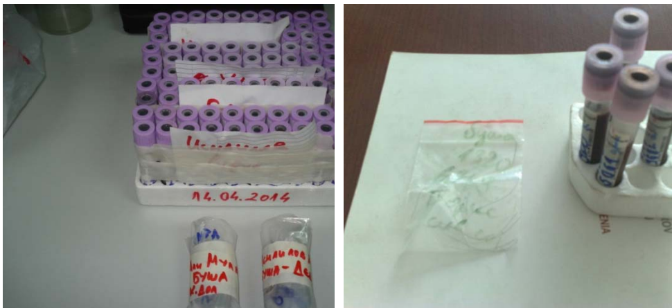
Pictures 3 and 4 Packaging and identification of blood and hair samples of Busha cattle